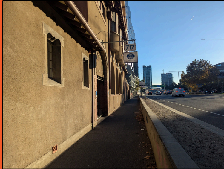
Stepped entrance via Flinders St.