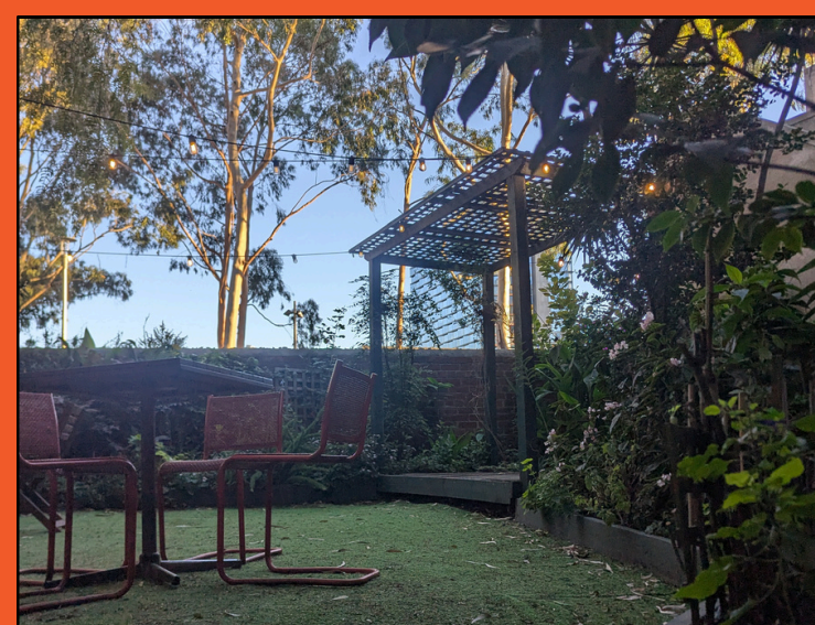
Garden connected to the courtyard, good for a quiet space.