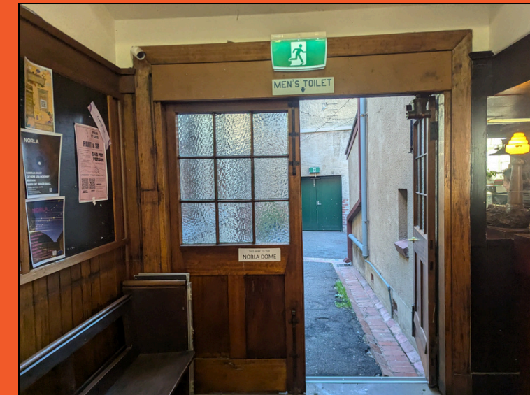
Exit to the accessible bathroom at the back of the Main Hall.