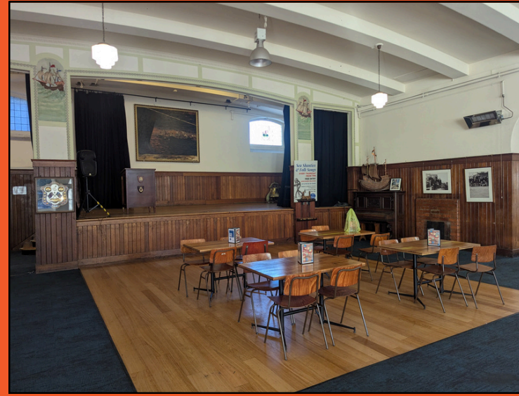
Main Hall, seats will be in rows and there is a bar in the back corner.