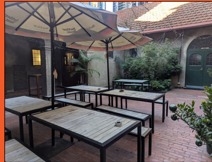
Courtyard connected to the Main Hall, good for a quiet space.