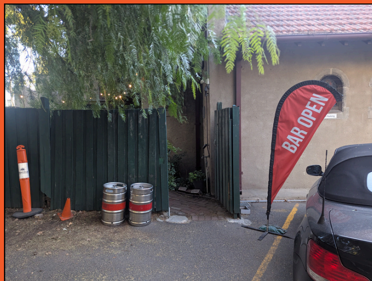
Accessible entrance via Siddeley St.