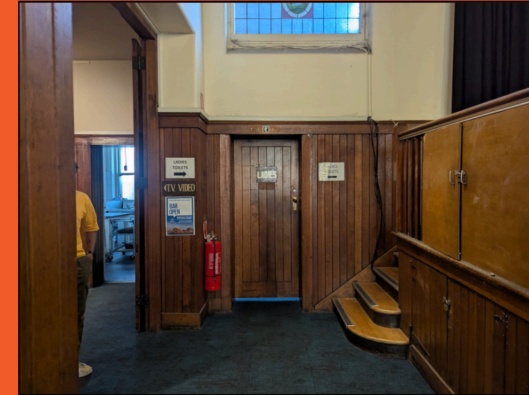
2 stall bathrooms in the back of the Main Hall. Not wheelchair accessible.