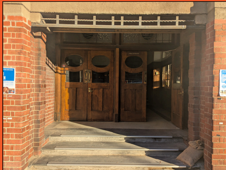
Stepped entrance via Flinders St.